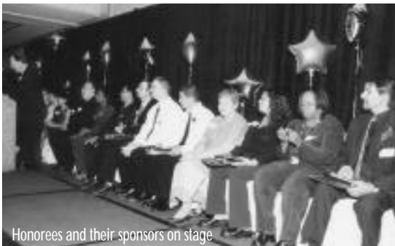
Honorees and their sponsors on stage